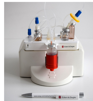
Modular-Lab easy in comparison with a ballpoint pen