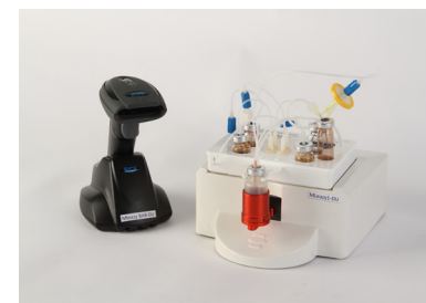
Modular-Lab easy with cassette and barcode reader